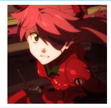
motorola_otaku OCS Forums $upporter