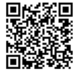
khw o CS Forums $upporter

Mar 02, 2012 Join Date: Posts: 105 Thanks: 67 Thanked 116 Times in 26 Posts