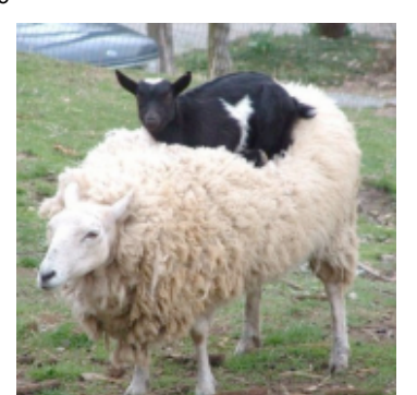
triptolemus O T<sup>1</sup> ÆS Ø - Moderator CS Forums $upporter