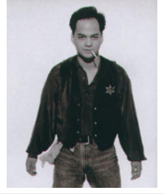
fulc OCS Forums $upporter

Join Date: Aug 25, 2014 Posts: 34 Thanks: 112 Thanked 156 Times in 45 Post